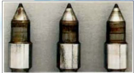
Injectors after using a detergent additive

New injectors have extremely close tolerances, reduced nozzle clearance with higher operating temperatures and pressures. Deposits can arise from varied and large sources such as refinery changes, biodiesel integration as well as other more traditional contaminant areas. Deposits can cause malfunctions of the injector and cause poor fuel flow. Magellan's diesel additive stabilizes bio blends preventing the formation of the precursors that may lead to injector fouling. Additional benefits from a detergent additive also include improved fuel economy and reduced emissions, which help to protect the environment.