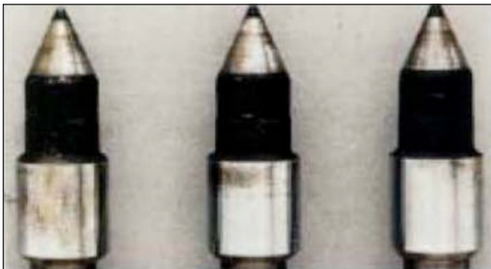
Typical injectors without a detergent additive

Magellan's diesel additive helps remove and prevent fuel system deposits and keeps fuel injectors free from carbon and varnish deposits. Clogged injectors can result in a poor spray pattern, robbing the engine of power and performance. It can also increase maintenance and fuel costs. Minimizing deposits has become of critical importance as fuel injectors become more susceptible to fouling.